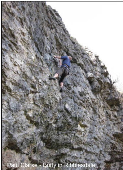
Paul Clarke - Bury in Ribblesdale

Approach 1 (as described in the YL Guide) – parking as for Panorama Crag on the Helwith to Austwick road. Cross the stile then right to the quarry and up to The Nab. Please don't obstruct traffic and park well away from Newfield House – it is equally easy to park nearer to Helwith and follow a path alongside the impressive edge of Dry Rigg Quarry, joining the original approach directly beneath the Nab. Please don't park dangerously – if there isn't space then use Approach 2.